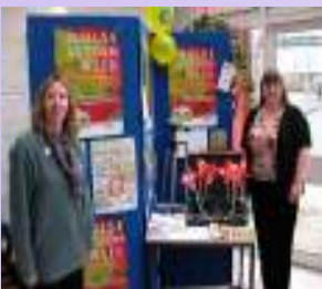
Some Noise Action Week 2005 activities on the Shetland Isles.

Other effective campaigns run throughout the UK included travelling roadshows, schools workshops; and radio and bus advertising campaigns. Some local authorities even donated and destroyed confiscated equipment, whilst others ran competitions and promoted their services using displays and stands. Overall, participants reported that they found the initiatives worthwhile and enjoyable.