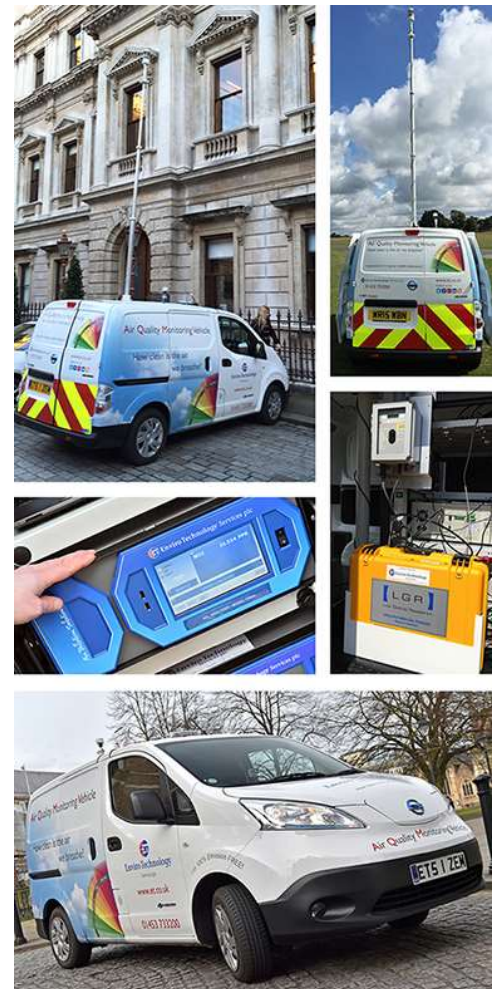
ET Technology Smogmobile in action